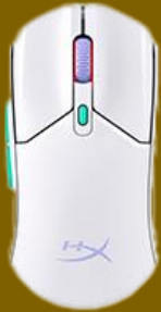
HyperX Pulsefire Haste 2 Mouse Worth Rs 9087/-*